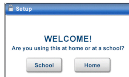
Figure 2 Setup Screen