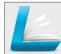
Figure 1 Lexia Reading App